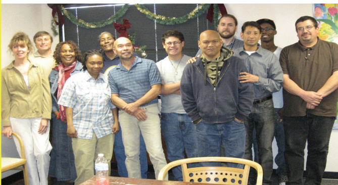
The latest Peer Counseling/Stepping Stones to Employment Graduation Class

To empower people with disabilities to live independently in the community, to make their own decisions about their lives and to advocate on their own behalf.