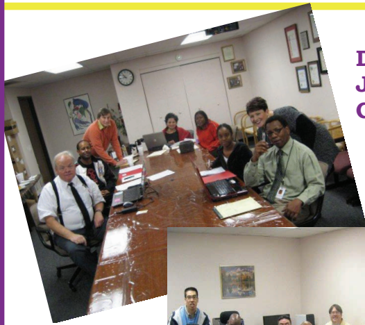
DRC's Job Club